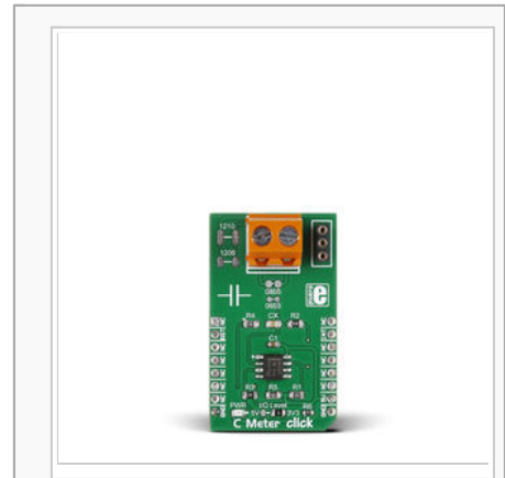
C Meter click